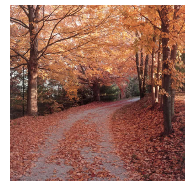
October visions of fall

Welcome to your newsletter! Now you can keep track of everything that is going on at BotC & the CHC for the month and beyond.