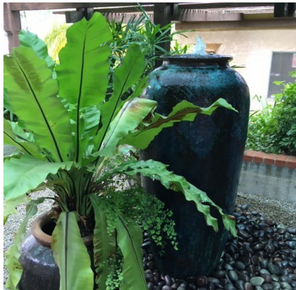
A hidden place of tranquility at BotC

Welcome to your newsletter! Now you can keep track of everything that is going on at BotC & the CHC for the month and beyond.