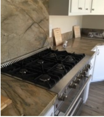
New Stove & Beautiful Countertops!