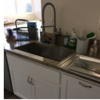
New Deep Sink, New Frig & Freezer, New Dishwasher, New Floor!