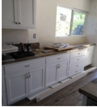
New Cabinets & New Windows!