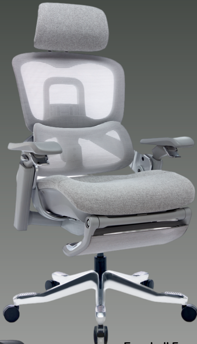
Eggshell Frame Silver Waved Mesh Grey Fabric Upholstered Seat