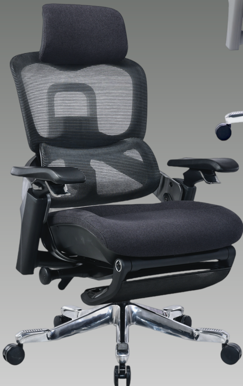
Black Frame Black Weaved Mesh Black Fabric Upholstered Seat