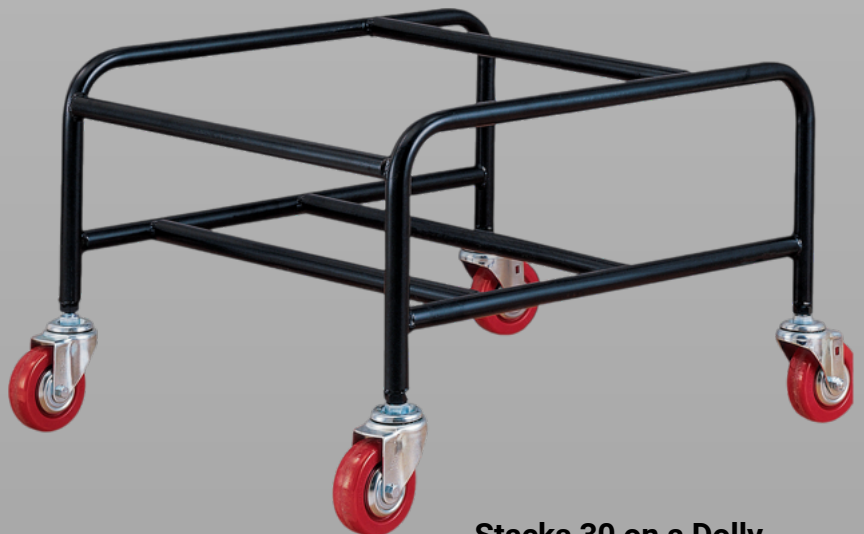
Stacks 30 on a Dolly