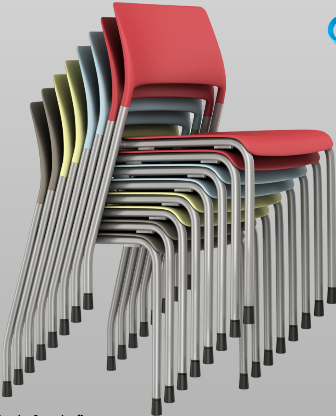
Stacks 8 on the floor