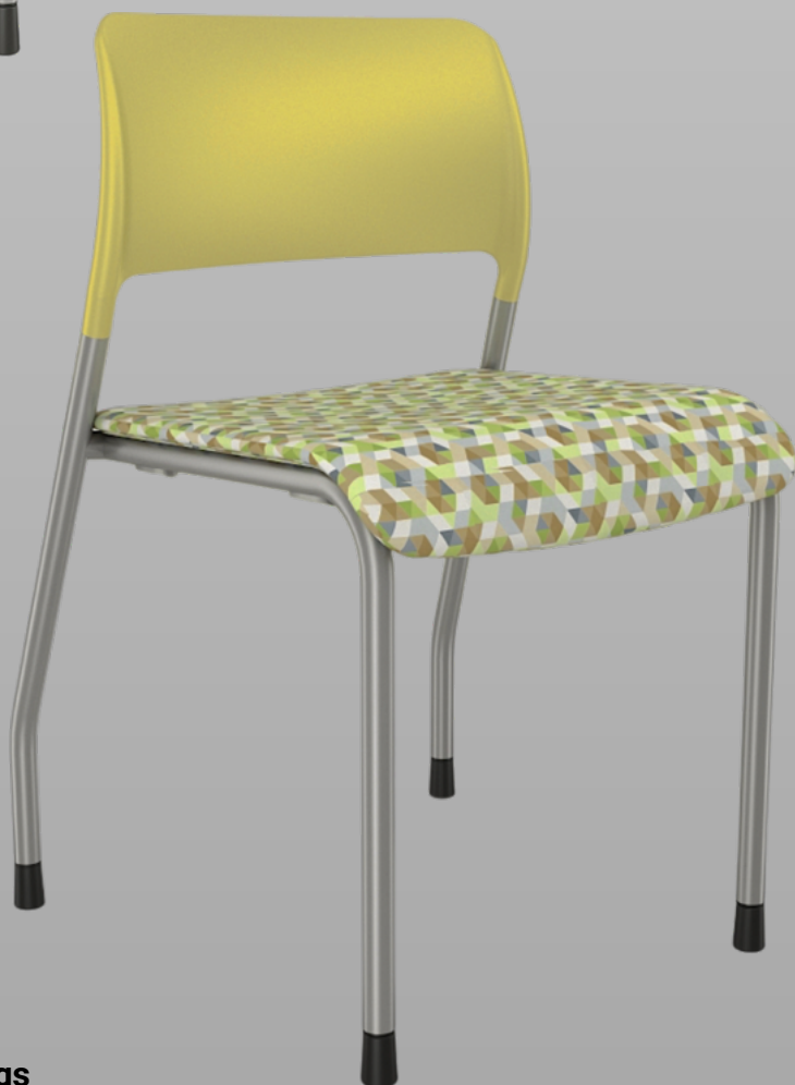
Room saver tip resistant back legs