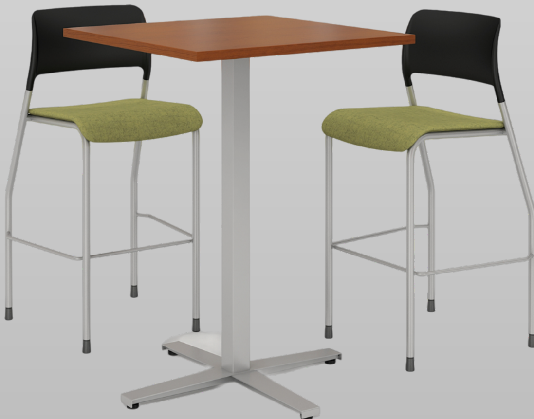
Infinity Stool Upholstered Seat