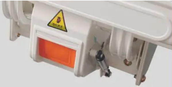
Auto-Lock Siderail For Convenient Installation And Detachment