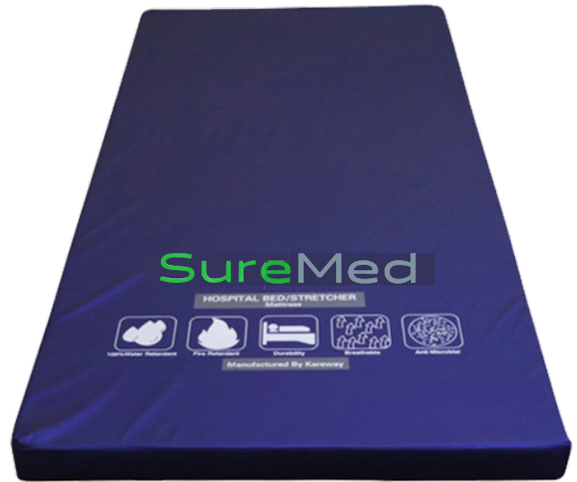
MATTRESS - SMM-04