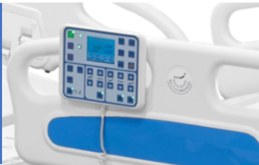
Full Function Patient Control Handset