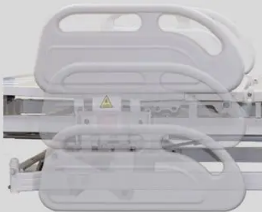
Stowable - Safety Side Rails

ABS Side Rails Install and Lock In place for patient safety. Rails can be tucked away when necessary.