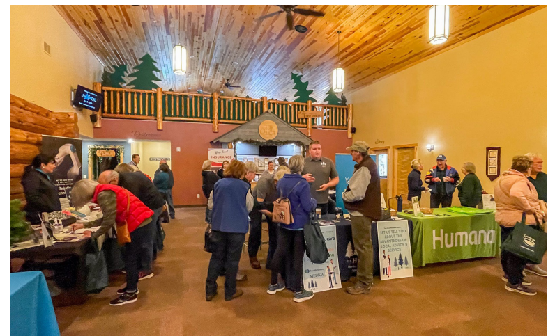
Attendees visiting Exhibitors booths at the 2023 Senior Expo in Crosslake