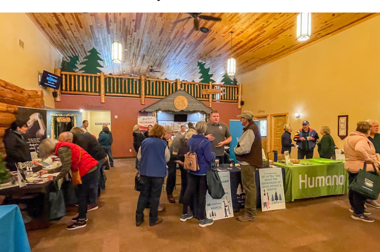
Attendees visiting Exhibitors booths at the 2023 Senior Expo in Crosslake