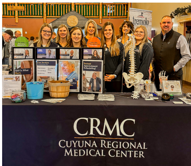
The staff of CRMC Orthopedics Department

If you need assistance with finding resources in our area, please visit our website. Under the resources tab you will find lots of information to direct you in finding help. Our goal at Crosslake Cares is to enhance access to senior services that connect existing providers with users.