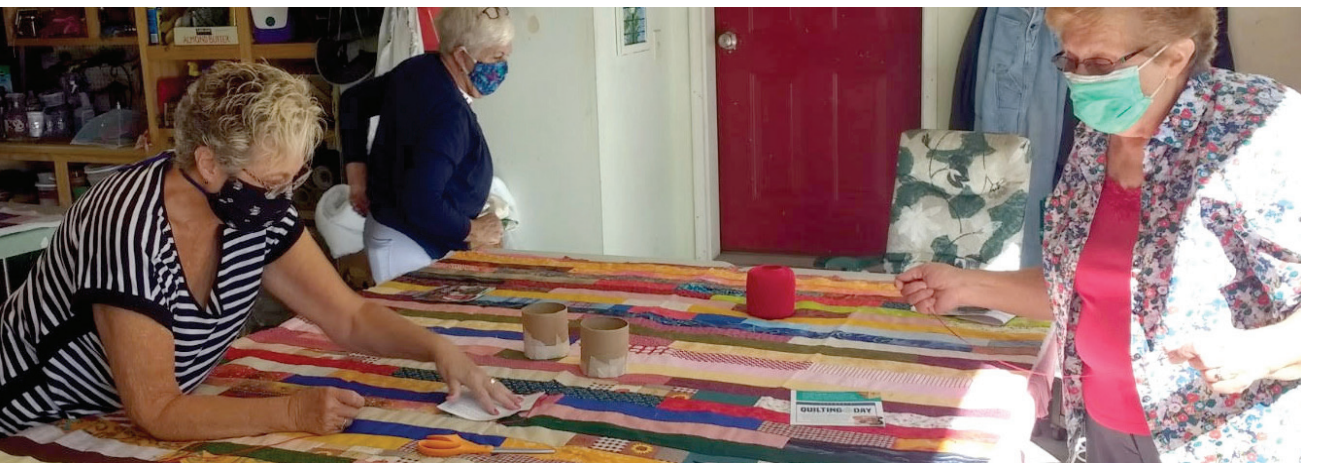
Quilters at Crosslake Lutheran Church