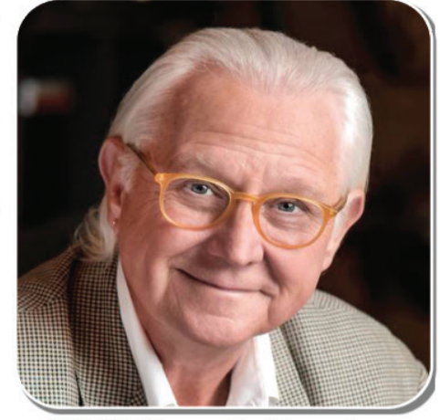
EXPO Keynote Speaker