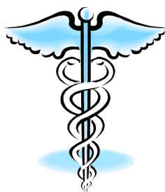
God Set The Standard

God set a standard for all of mankind to look to the cross for deliverance. This was something for mankind to look forward to as well.