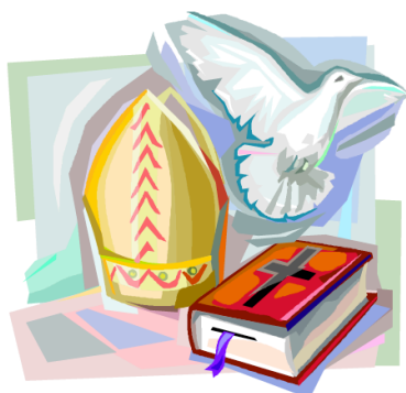
Holy Spirit Empowers The Standard

Holy Spirit delivers the Kingdom of God with His fruit, gifts, love, light and Zoë life.