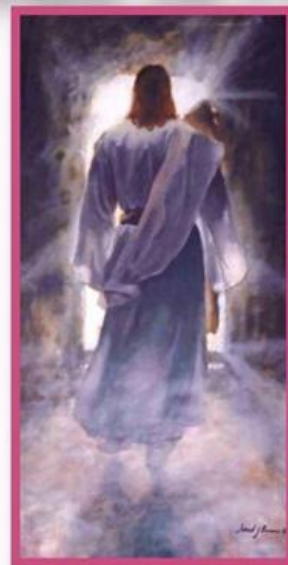
Portrayal Of Jesus Leaving Gravesite!