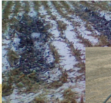
Ruts in a corn field after snow

The coultter kits include; 18" 13 wave boron "earthen harden" coultter blades. (Using your existing shanks.)