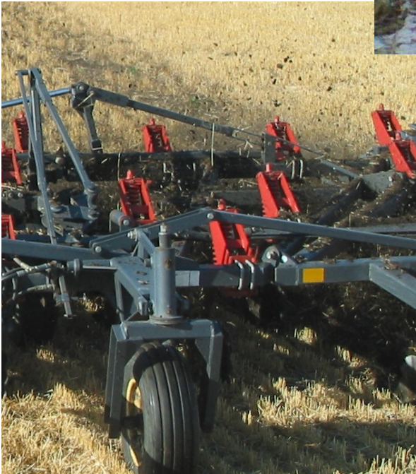
Coultter kits in action