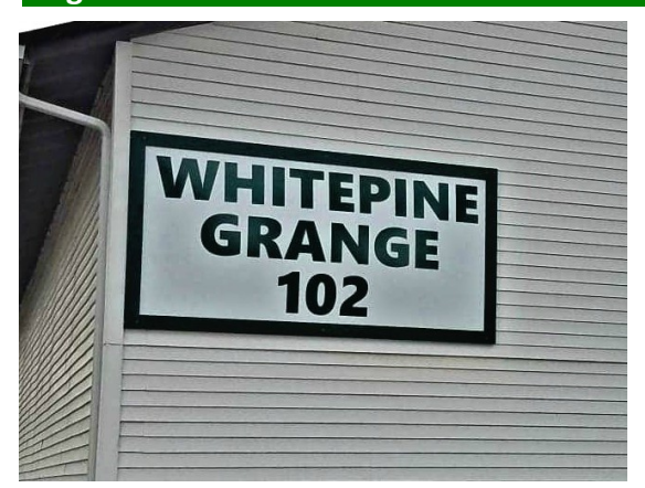
Above: A large, bright sign now makes the Grange more visible from the highway.