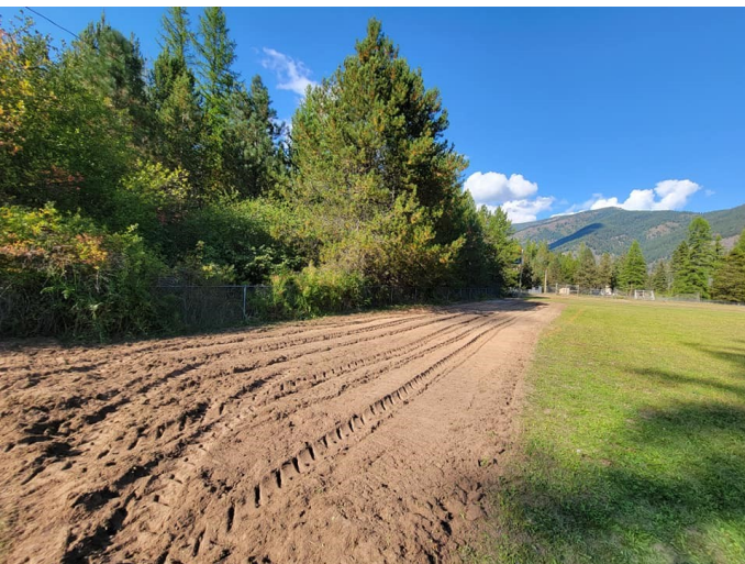
The freshly tilled garden plot at Trout Creek School