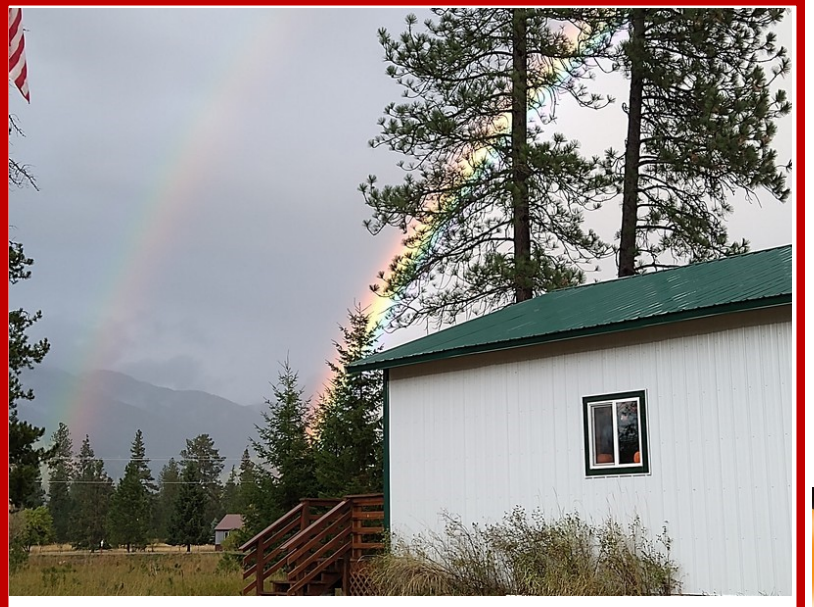
A double rainbow crowns Whitepine Grange on a recent fall evening.