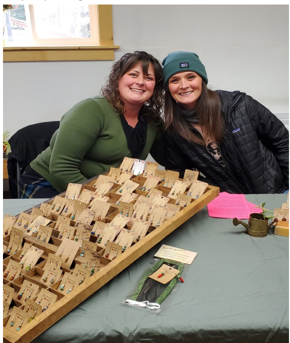
Two of last year's happy craft exhibitors