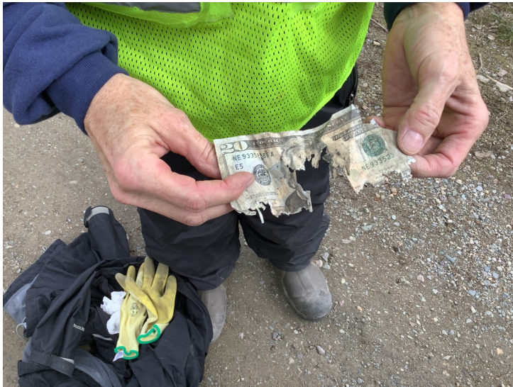
Debb McNary found a tattered but still negotiable $20 bill on the roadside during highway cleanup.

Picking up highway litter is a mixed blessing. On one hand, we all get disgusted at the folks who trash our roads and countryside. On the other hand, the act of picking up after them can become quite entertaining.