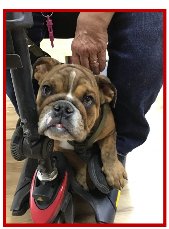
This little English bulldog pup was definitely NOT FOR SALE but he deserved to have his picture taken!