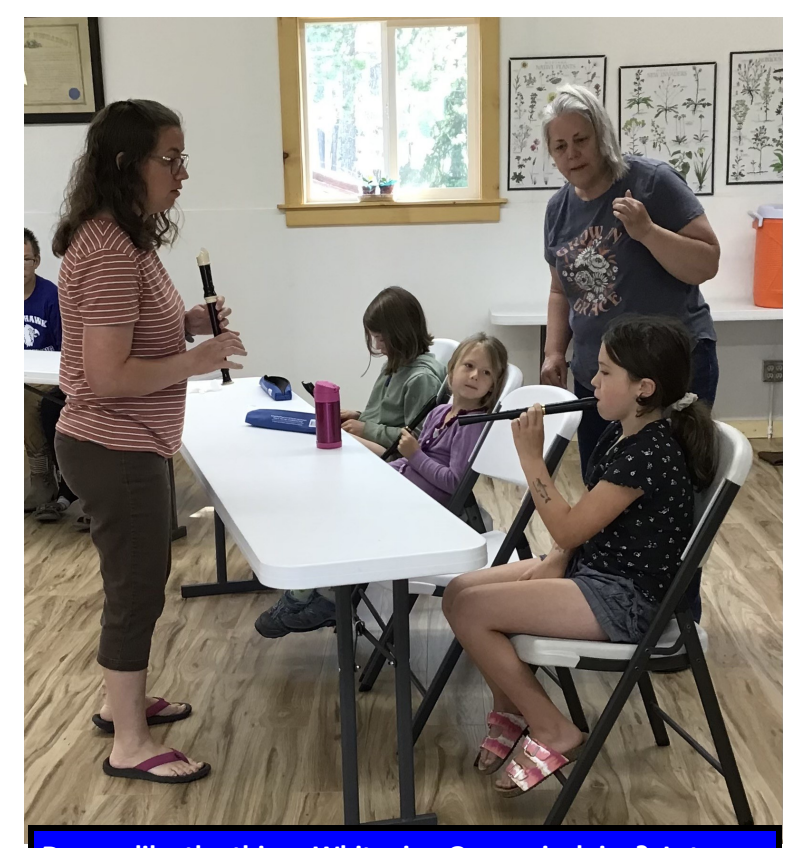
Do you like the things Whitepine Grange is doing? Let us know! We want and need your support to become the Community Center our area needs!