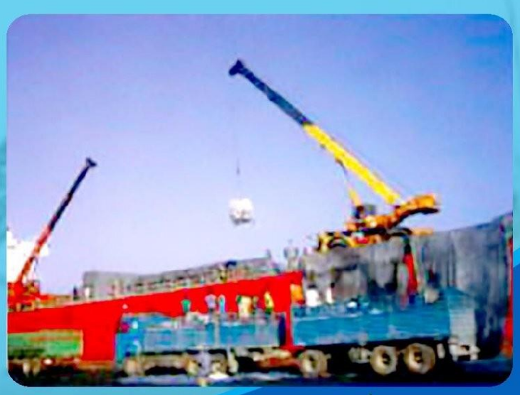
we promise, we deliver