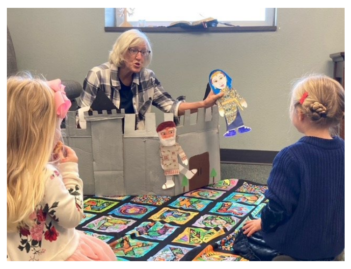
God's Word, Our Story

Join us Sundays 9:45-10:15 In the HTLC Library for a story and a project. All ages are welcome!