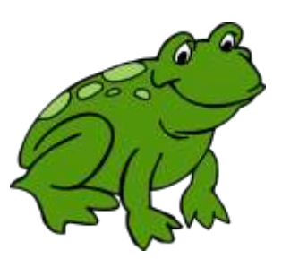
Warning: The Frogs are on the loose!!!!