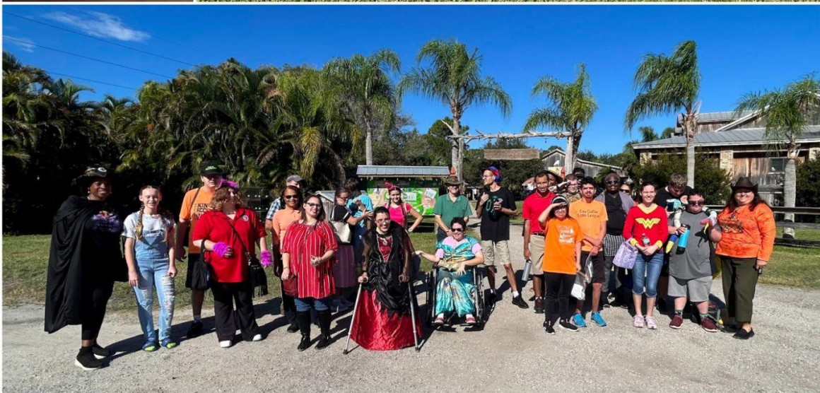
By Covert Wordsmith LLC on November 01, 2023