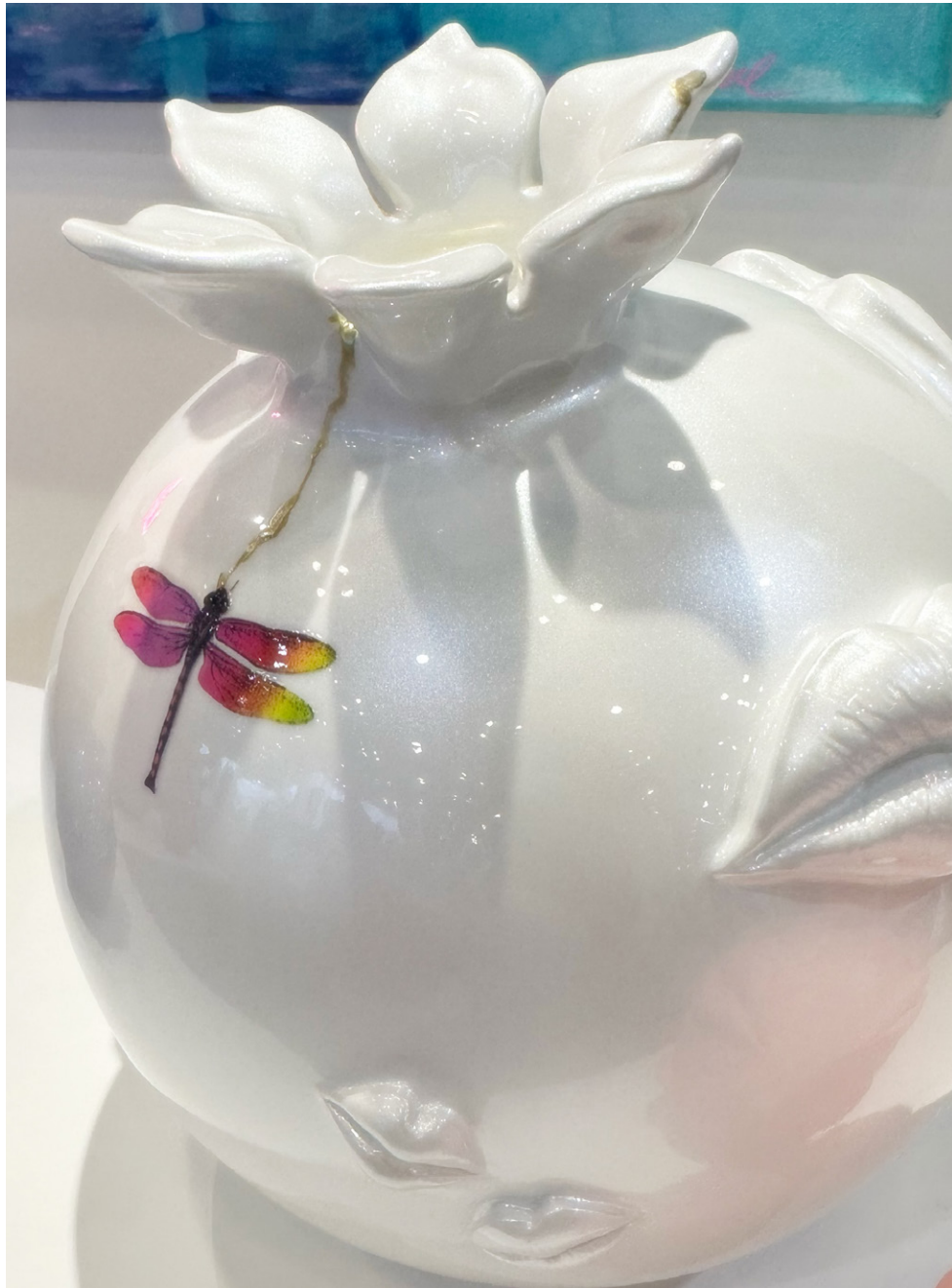
Pearl white with UV-printed dragonfly and handpainted elements