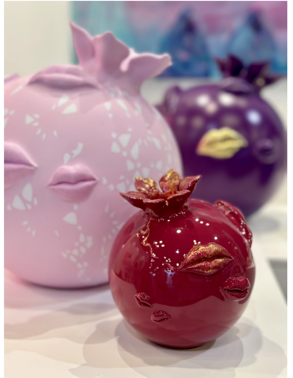
Individual designs like: broken Arabic structures or special colors for the lips