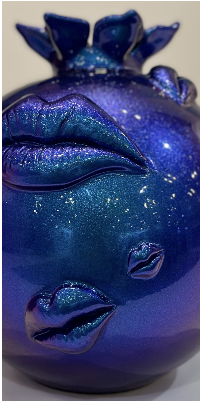
Color-shifting pigments (from blue, to green, to magenta, to black)