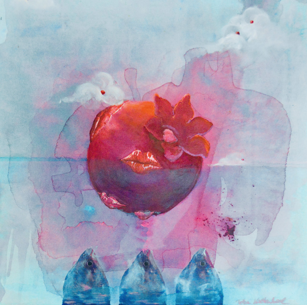
Painting: UNDERWATER LOVE