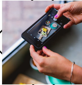
YOUR SMART PHONE