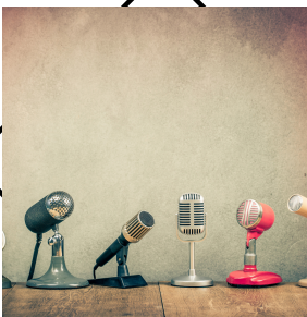
MICROPHONE OR GOOD AUDIO