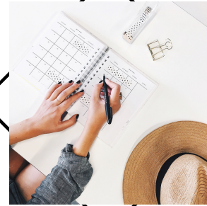
NOTEBOOK & PENS