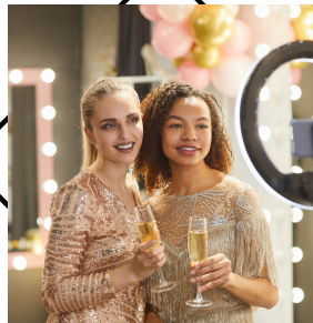
RING LIGHT OR GOOD LIGHTING