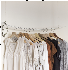
ITEMS ORGANIZED & NUMBERED