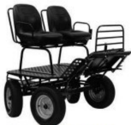
Fun Bug GL RS

All Bennington Carriages are made with pride in the UK using the finest materials and expert craftsmanship.