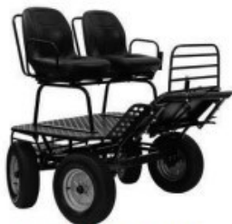
Fun Bug GL RS

All Bennington Carriages are made with pride in the UK using the finest materials and expert craftsmanship.