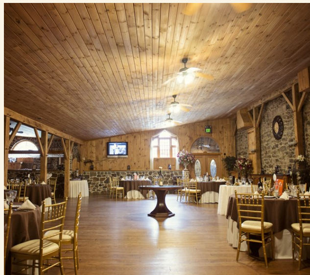
The Cove capacity 85

Windsor Court is the coziest and most intimate room at Kings Mills. Windsor comes with a large, covered outdoor space with seating for your guests to enjoy the property.