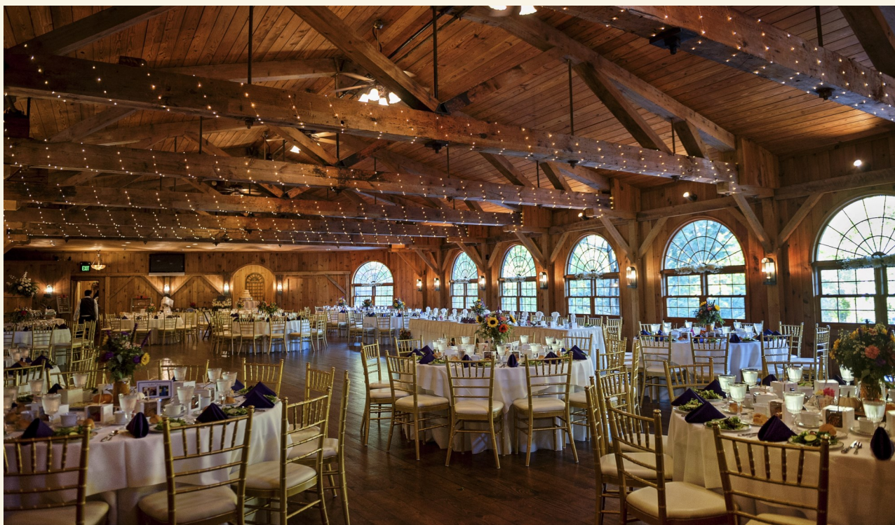
Camelot capacity 240