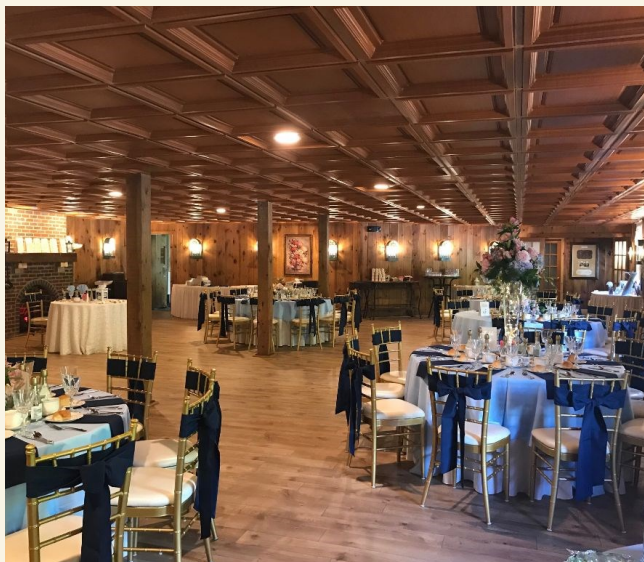
Windsor Court capacity 100

Windsor Court is the coziest and most intimate room at Kings Mills. Windsor comes with a large, covered outdoor space with seating for your guests to enjoy the property.