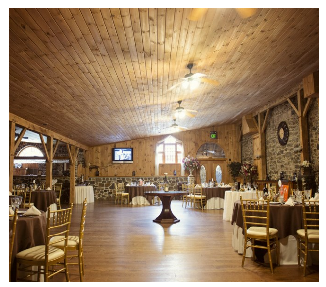
The Cove capacity 85