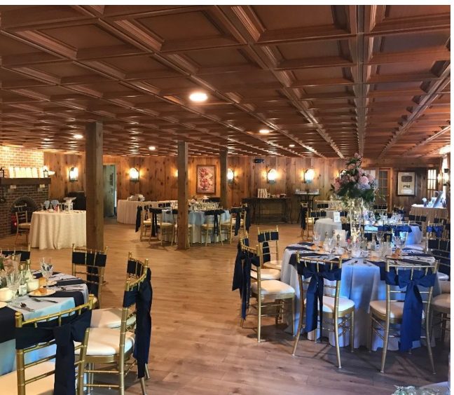
Windsor Court capacity 100