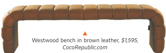
Westwood bench in brown leather, $1,595, CocoRepublic.com