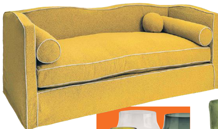
King George Sofa in nubby gold, $6,545, DanielHouse.club