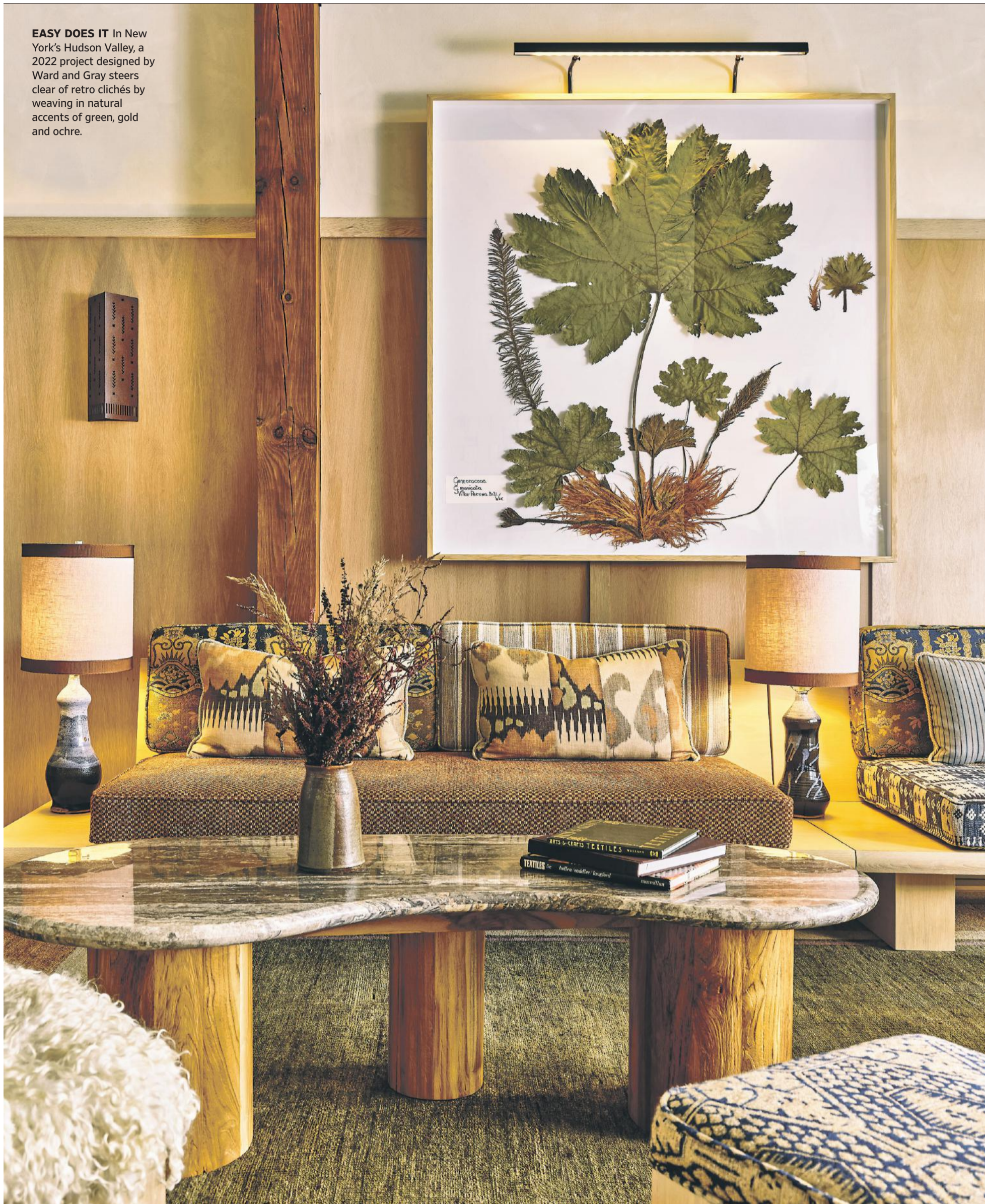
READ MCKENDREE/BSA (LIVING ROOM); GE (ARCHIVAL AD)

EASY DOES IT In New York's Hudson Valley, a 2022 project designed by Ward and Gray steers clear of retro clichés by weaving in natural accents of green, gold and ochre.