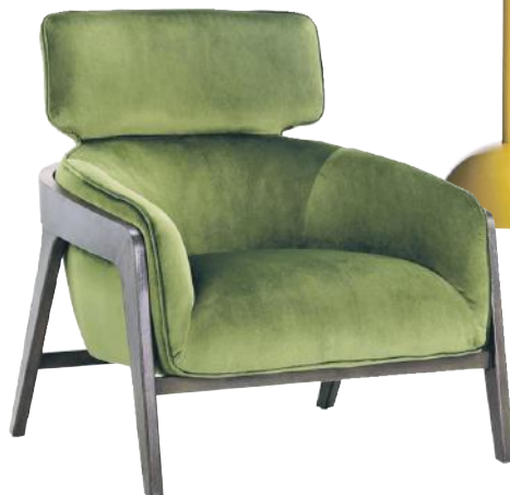
Maximus Lounge Chair in moss green, $2,067, ShopBlytheInteriors.com