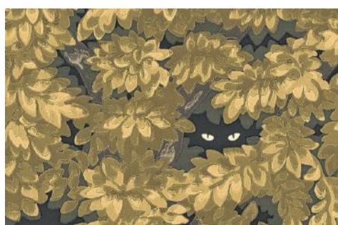
Creatures of the Night wallpaper, $433 per roll, ZakAndFox.com