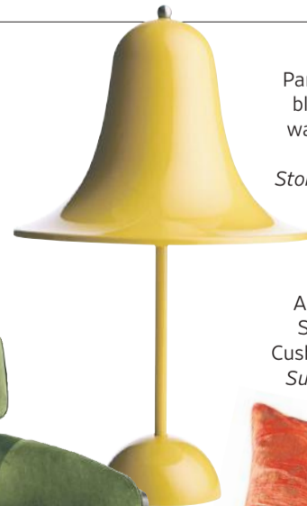
Pantop Portable Lamp in warm yellow, $150, Store.Moma.org