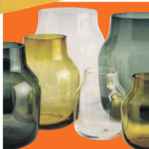
Silent Vase by Andreas Engesvik (available September 21), from $55, Us.Muuto.com