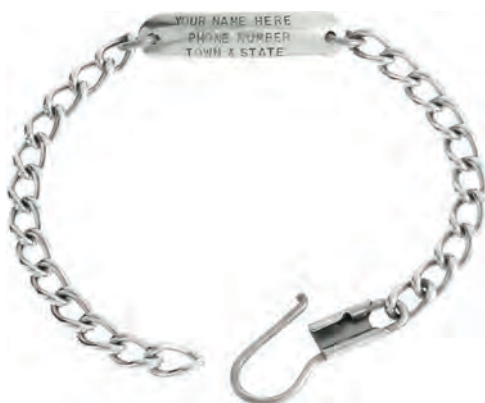
Lifetime Collar with regular fastener (Custom pliers available, page 3.)