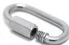
QUICK LINK fasteners available for easy attachment and removal

SlipCheck Company's specialty, the Lifetime Dog Collar, features a unique design, fine materials and excellent craftsmanship that has earned thousands of satisfied, repeat customers since 1957.