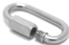
QUICK LINK fasteners available for easy attachment and

SlipCheck Company's specialty, the Lifetime Dog Collar, features a unique design, fine materials and excellent craftsmanship that has earned thousands of satisfied, repeat customers since 1957.