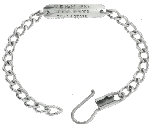
Lifetime Collar with regular fastener (Custom pliers available, page 3.)