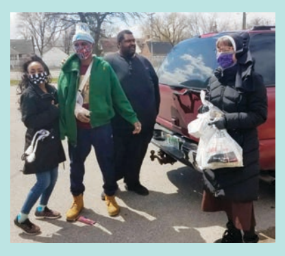
Curbside pickup was initiated during the height of the COVID pandemic.