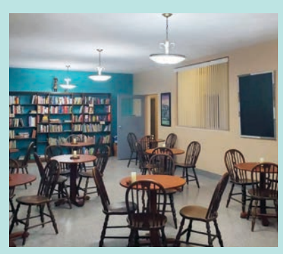
The Deo Gratias Cafe' was renovated with the help of several volunteers.