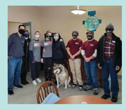
Family & friends help Deo Gratias with the online auction product distribution.

Together, the leaders, staff, volunteers, and clients mold an atmosphere of love and respect.