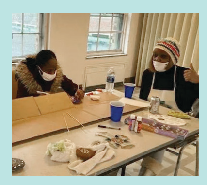
Art classes are offered for both children and adults.