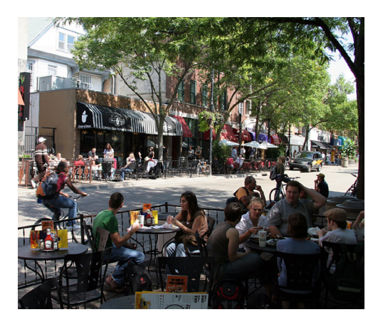
The East End will be a place for shopping, dining, and entertainment

These five plan elements serve as the building blocks for this study and were used in developing the overall Master Plan. Each of the elements are reflected in the plan's goals and objectives but also further define the physical and non-physical elements of the overall plan. The layering of the five plan elements resulted in the development of an overall Master Plan which is illustrated in detail in Chapters 3 - 7.