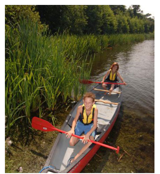
The East End will be a place for family recreation, festivals, and fun