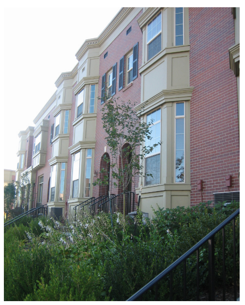
Example of residential townhomes