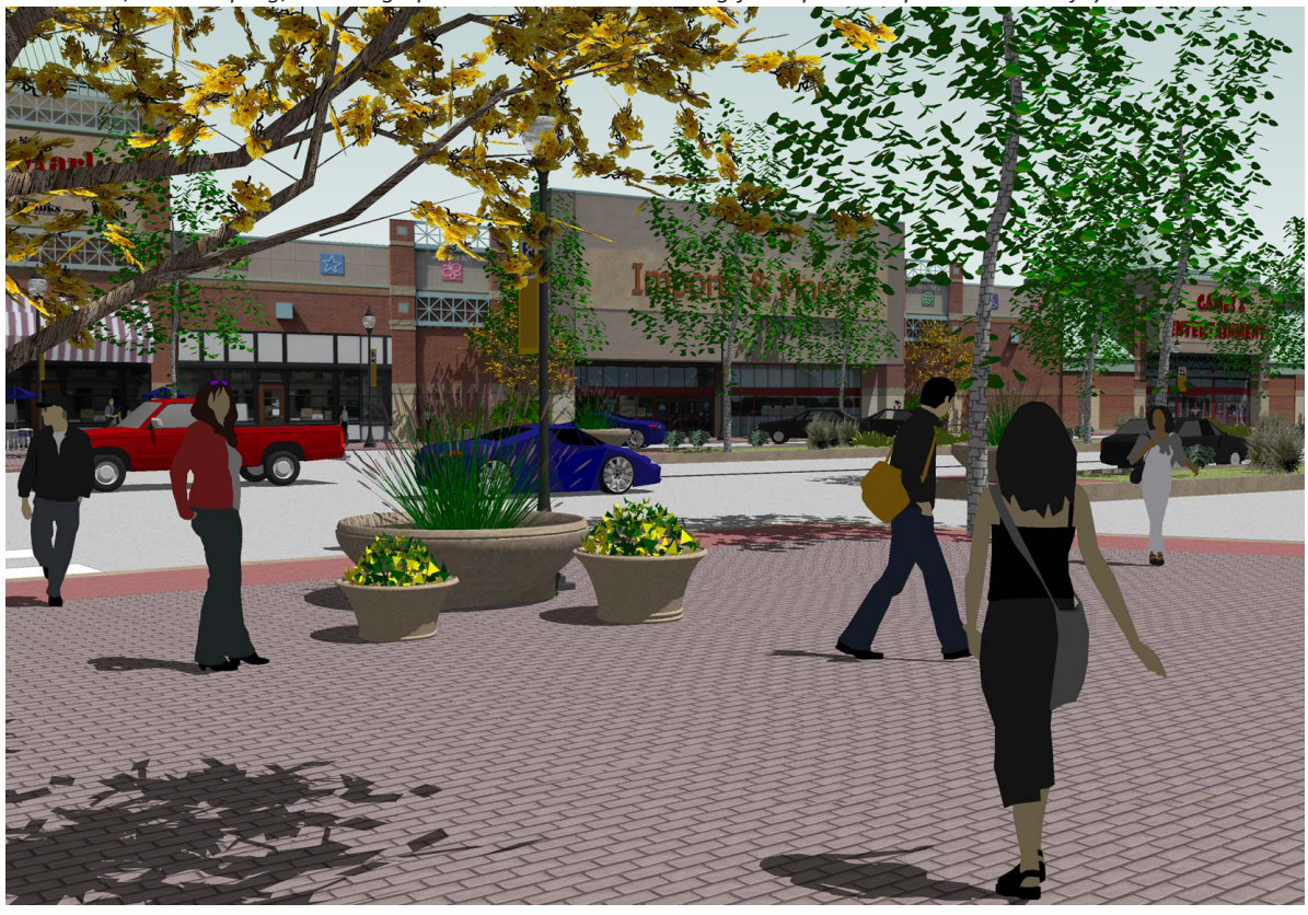
Curb extensions, landscaped median, decorative pavement, and wide striped crosswalks increase safety for pedestrians.