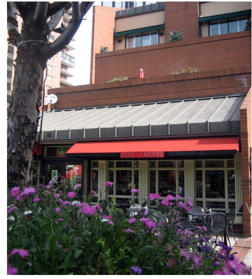
Example of mixed-use building

The combination of commercial, retail, and residential is important in creating a vibrant and sustainable downtown. Residents provide a population base to support businesses in the area in addition to providing after hours street activity.