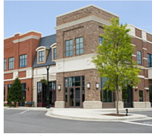
Example of commercial development with angled parking and curb extensions.

More suburban in nature, this commercial area is focused inward rather than oriented toward major roadways. Landscaping should be required in all parking areas in addition to mandatory pedestrian sidewalks and crosswalks. The layout of the buildings should allow a visitor to safely and easily access all areas by foot. Outdoor commercial activities, such as dining, should also be encouraged. The maximum building height should be two stories or 24 feet.