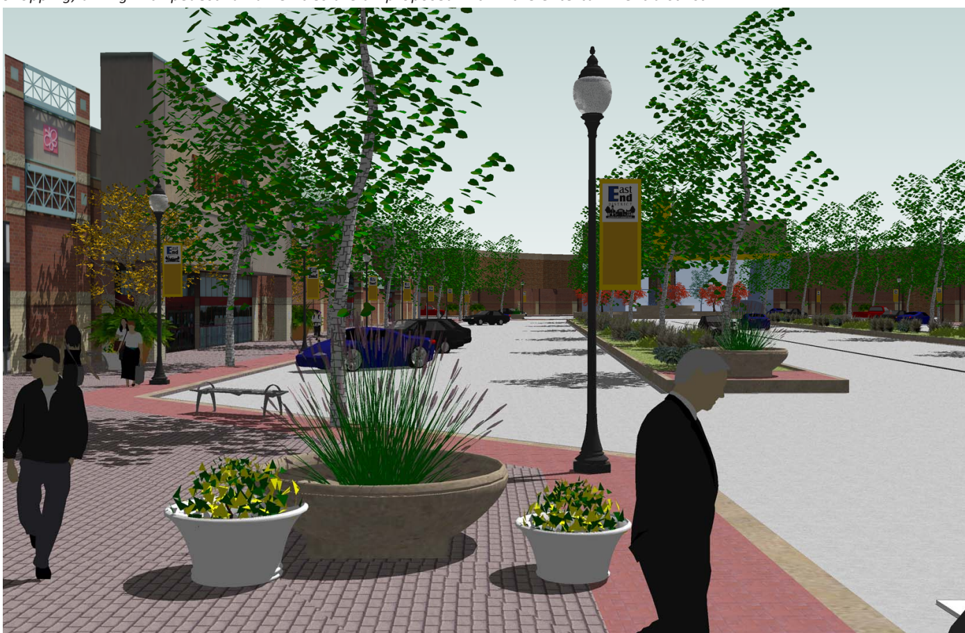
Shopping, dining with pedestrian amenities are all proposed within the entertainment district.

Like all areas within the East End, residential development should be oriented towards the street. Building setbacks can be greater in this area than are as with more intense development, but should still reflect an urban nature with a maximum front setback ranging from 20 to 35 feet. The maximum building height for all residential, including townhomes, should be three stories or +/- 36 feet.