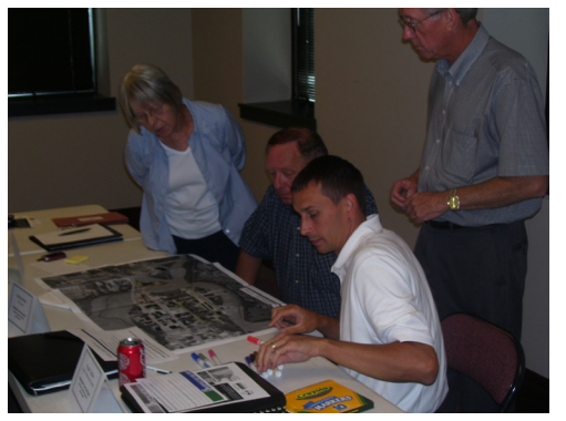
Steering Committee Meeting