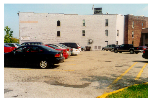
Lowest rated image by public meeting participants.