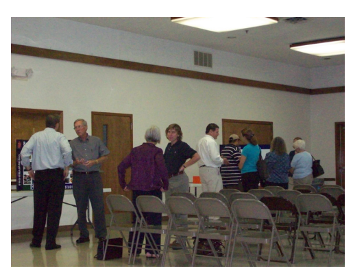
Public Open House