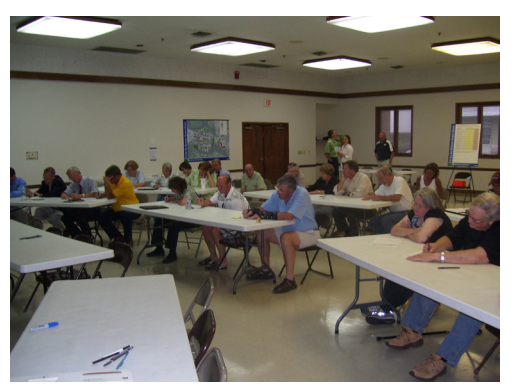
Public Visioning Workshop