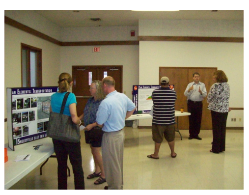
Public Open House