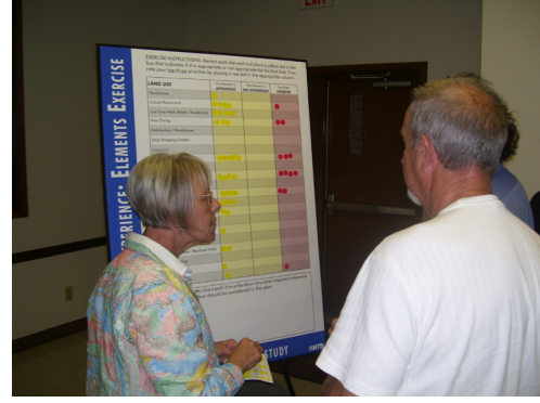
Public Visioning Workshop

Gathering information and ideas early in the planning process is critical to the success of any plan. HNTB facilitated a two-hour workshop designed to gather input from residents of Shelbyville on the future of the East End. Attendees participated in three exercises aimed at identifying the desires of the community. Throughout the evening, participants were able to learn more about the project and existing conditions, voice their opinions, and express their vision for growth through the following exercises: