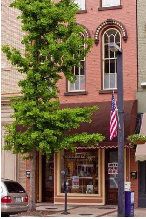
Highest rated image by public meeting participants.