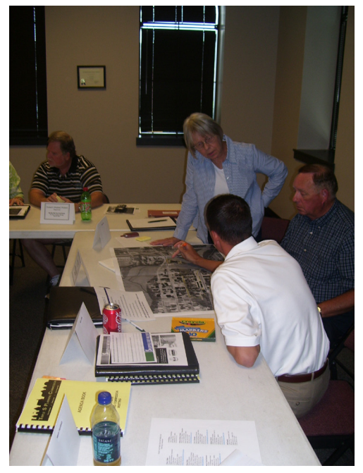
Steering Committee Meeting

The purpose of the final Steering Committee meeting was to review the draft plan document to ensure all of the concepts and ideas presented in the study accurately reflected the input provided. The plan document was revised based on the Steering Committee's input prior to the adoption draft being forwarded to Triple S Planning Commission and the City Council.