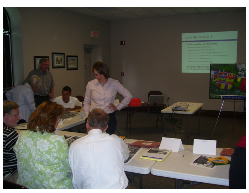
Steering Committee Meeting