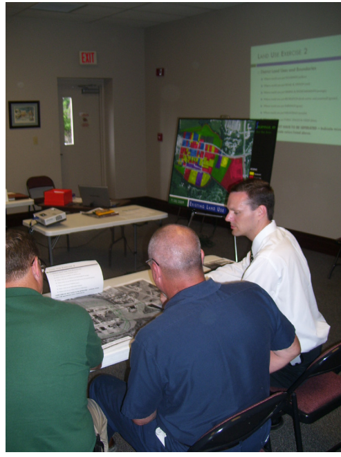
Steering Committee Meeting

top issues were identified as inconsistent / poor streetscape, poor land uses, lack of a downtown identity or look, lack of investment, poor transportation network (including pedestrian), lack of diversity in retail, lack of recreational opportunities, poor sense of safety. The top opportunities included the ability to provide a consistent streetscape or downtown appearance, new growth and development, expand recreational opportunities, provide a gateway into Shelbyville and expand the transportation network (including pedestrian).