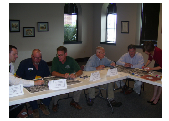
Steering Committee Meeting

Issues and Opportunities Identification – Steering Committee members were asked to identify the top three issues and opportunities in the East End. The