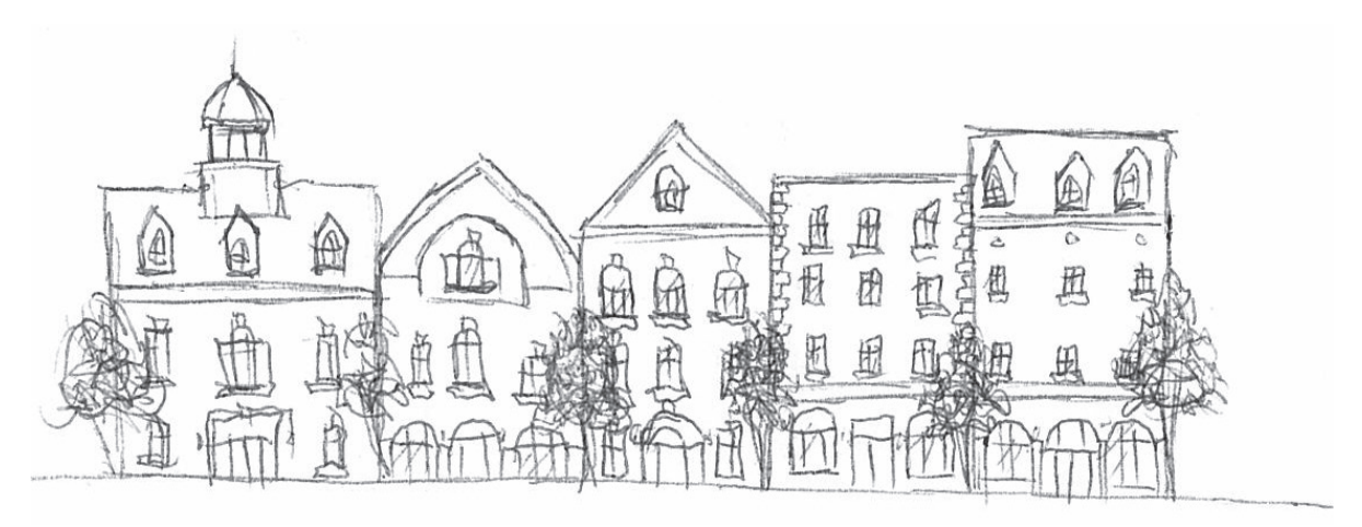
Sketch provided my Open House participant on their vision of the future East End