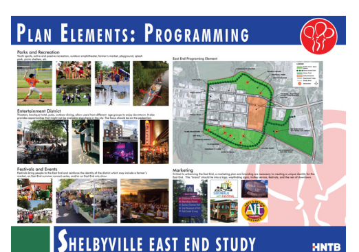
Example of display board used at Public Open House.