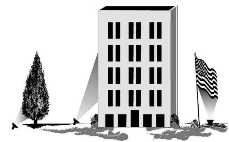
Lighting used for architectural/landscaping lighting shall be aimed and controlled so that light is confined, as much as possible, to the objects that are intended to be lit.

so that the directed light is substantially confined to the object intended to be