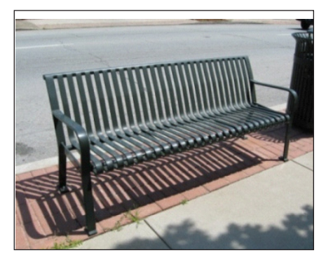
Limited streetscape that reflects downtown character and amenities