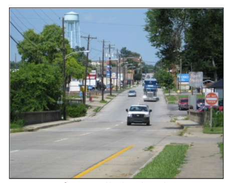
Mixture of controlled vehicular access and numerous curb cuts