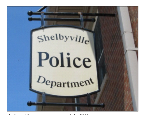
Adaptive reuse and infill