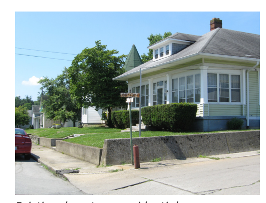
Existing downtown residential

The Building Exterior Quality (BEQ) Design Overlay District is intended to promote high quality development along commercial areas within Shelby County. Detailed standards and regulations building materials, sign and utility regulations, and design review are outlined in the ordinance. The BEQ overlay district was presented to the public at hearing in the spring of 2009. The overlay ordinance has not been applied to a specific corridor within Shelby County as of August 2009.