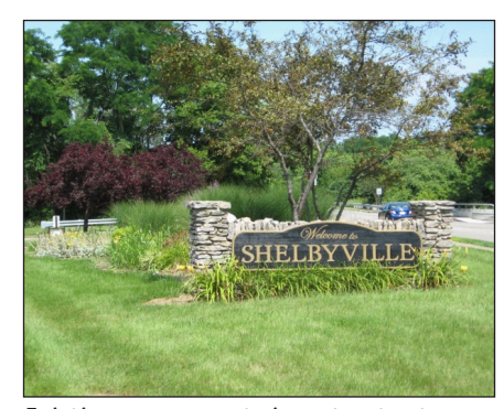
Existing monument sign at entry to East End