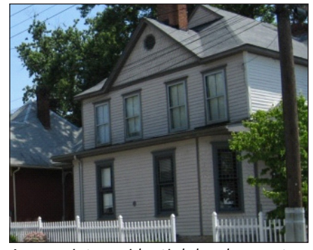
Appropriate residential development