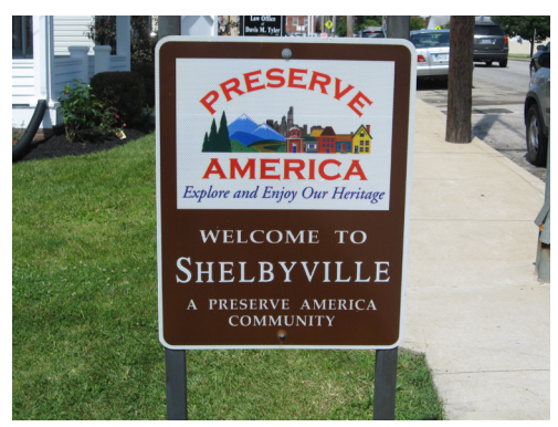
A portion of Shelbyville's Downtown Historic District is located within the East End study area.