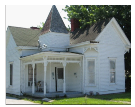
Mixture of residential types and investments