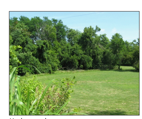
Under used open space