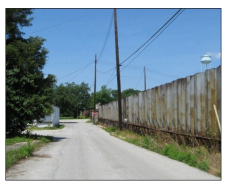
No pedestrian access