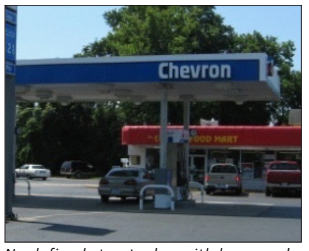
No defined street edge with large curb cuts