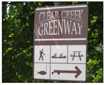
Under used greenway