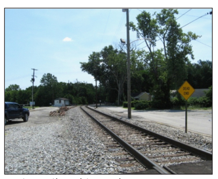
Active railroad in study area