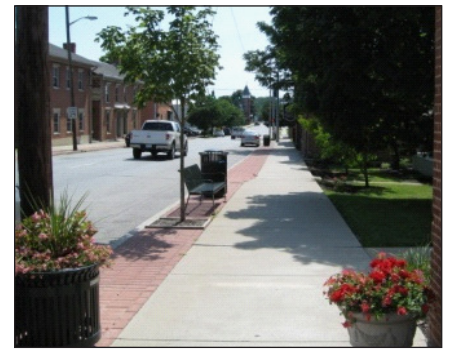
Appropriate streetscape in limited areas