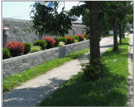
Sidewalk access without building facade at street