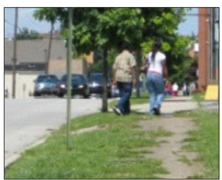
Sidewalks that are not maintained