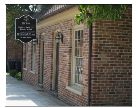
Mixture of historic reuse and infill