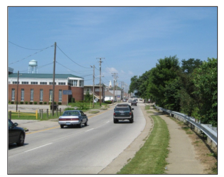
Transportation network primarily serves cars and trucks