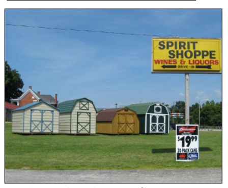
Land uses that do not reflect a downtown character