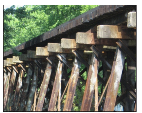
Unique architectural assets and forms