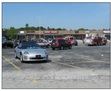
No focus on the pedestrian