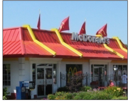
Standard / corporate architecture found anywhere