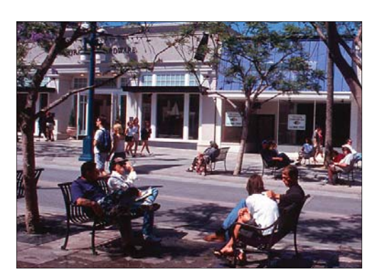
Vibrant Village Center