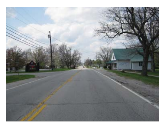
US 60 through Simpsonville