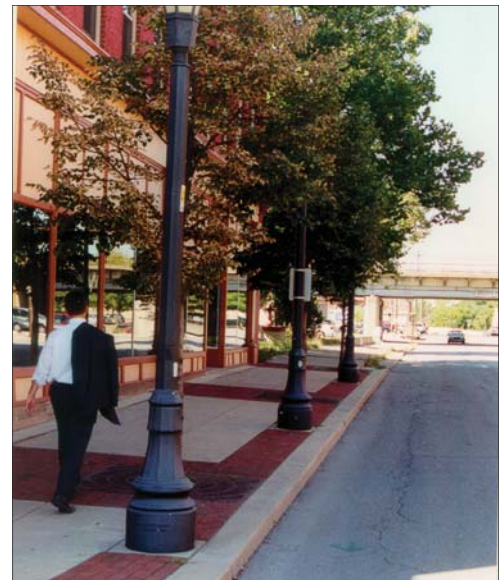
Preferred Permanent Landscaping Example