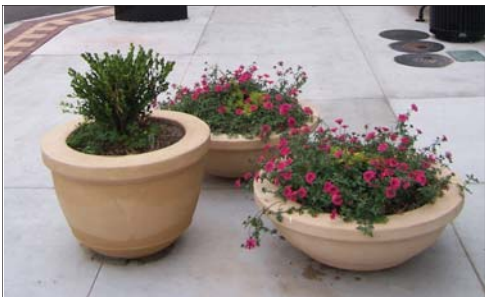
Preferred Accent Landscaping Example

The bench design should, like all of the amenities, be simple and traditional. Clean lines and simple colors can reinforce the district's identity. The optimal placement of street benches is within the carriage strip in a location that will get afternoon shade during the summer months. Additionally, boutiques, theaters, museums and other uses where some members of a party may need to wait on others are uses that typically benefit from the placement of a bench.