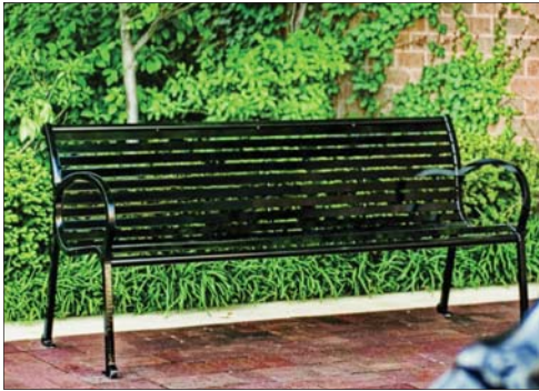
Preferred Bench Example

Finally, stormwater planters should be considered in areas with stormwater management issues or areas where runoff can be controlled in this manner. The life-cycle costs and benefits of reduced runoff of this landscaping option should be considered in decisions on their location.