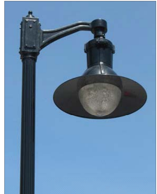
Preferred Lighting Example

Surface parking lots can detract from the visual appearance of the streetscape and overall area. Public comments encouraged the use of screening parking lots with landscaping in order to enhance the surrounding area. Screening parking lots with landscaping or a buffer between the parking lot and sidewalk / street can also help to maintain the separation of vehicles and pedestrians. The City and Planning Commission should also review the zoning regulations on landscaping within the Village Center.