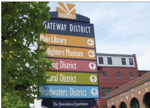
Example Vehicular Signage

Vehicular signage is intended to direct vehicles to attractions within the Village Center, such as parking, public gathering spaces or major destinations. Information on all signage should be kept up-to-date and all directional signage should have a consistent design and color scheme and depict the district's name and / or logo.