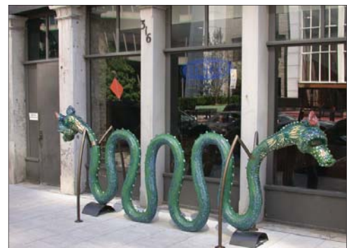
Example Public Art - Sculpture Serves as a Bicycle Rack

The Village Center gateway is shown in the illustration above. While the illustration does not represent the final design, it is intended to portray the visual image of Simpsonville. The spire image represents the equine history and culture of Simpsonville while the banner allows for a simple identification of the City. Detailing in the stone base should portray Simpsonville’s rich history as the “American Saddlebred Horse Capitol of the World.”