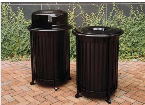
Preferred Trash Receptacle Example

It is recommended that trash receptacles be located at all intersections along U.S. 60 and at mid-block locations within the Core District. They should also be placed near entrances to uses that tend to generate waste, such as restaurants or stores that sell food items.