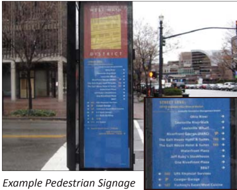
Example Pedestrian Signage

A reliable, pedestrian oriented wayfinding signage system is a hospitality tool which encourages visitors and residents to walk between destinations by providing accurate and reliable prompts to major walkable destinations. It is crucial for these elements be kept up-to-date with current information. All directional signage should have a consistent design and color scheme and depict the district's name and/or logo.