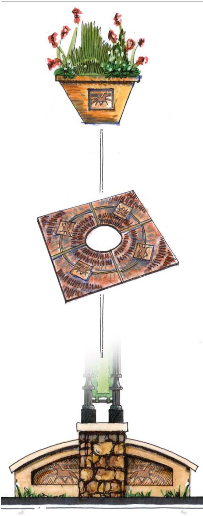
Horse details in Streetscape Elements

Interpretive pieces of art can be commissioned by local or regional artists that tell residents and visitors of Simpsonville’s culture. This could be through creative paving markings, sculptures or a variety of other mediums. Educational information can also be provided through signs or markers that tell Simpsonville’s story.