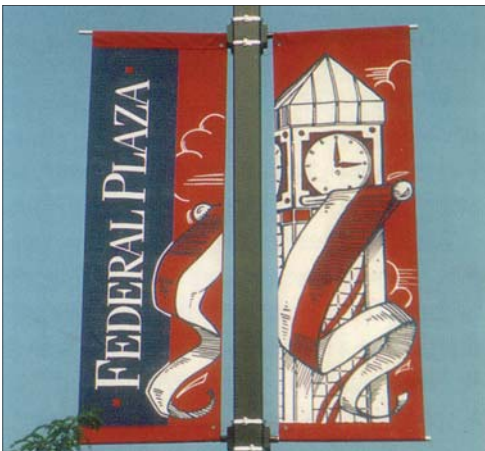
Preferred Street Banner Style

Accent landscaping includes plants that need annual or semi-annual maintenance or planting such as flowering beds or large pots. Accent landscaping can add color to the streetscape. If large pots are used, they can vary in size but should be consistent in style. Approved species of vegetation should also be developed to provide consistency within the Village Center.