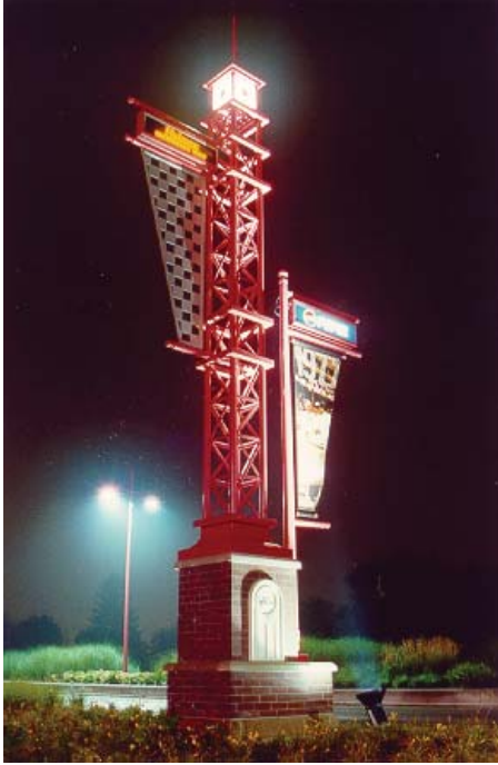
Example of a Gateway Feature