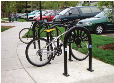
Preferred Bicycle Rack Example