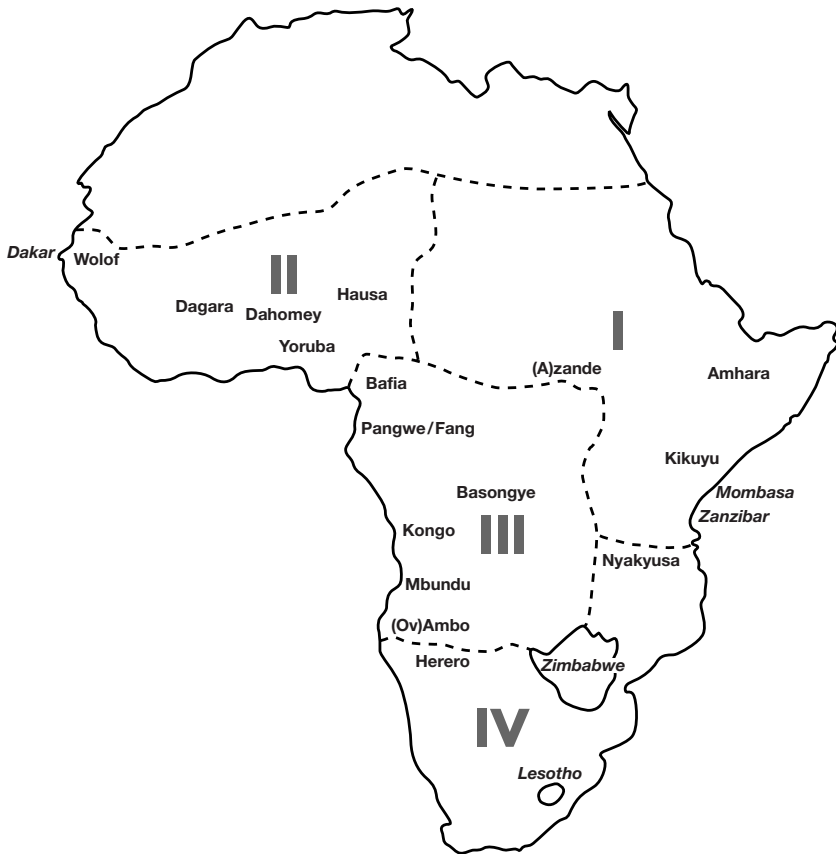
Figure P.1. Key groups and places discussed.

compounds across the African continent” (1984: 50). With so many African men working away from their homes, it would be unusual for African women not to turn to each other, as indeed they do in the southern African homelands. Unfortunately, no one has seriously looked for parallels to South African woman-woman relations elsewhere in the continent, and very little has been published on female homosexuality in the labor reserves of Central Africa. Only in recent years has a body of retrospective accounts by lesbians in South Africa begun to appear, which describes their experience of growing up invisible to themselves (but not always to others). 12 Some work has been done in documenting marriages between African women (see the final section of this book). While this practice has been reported