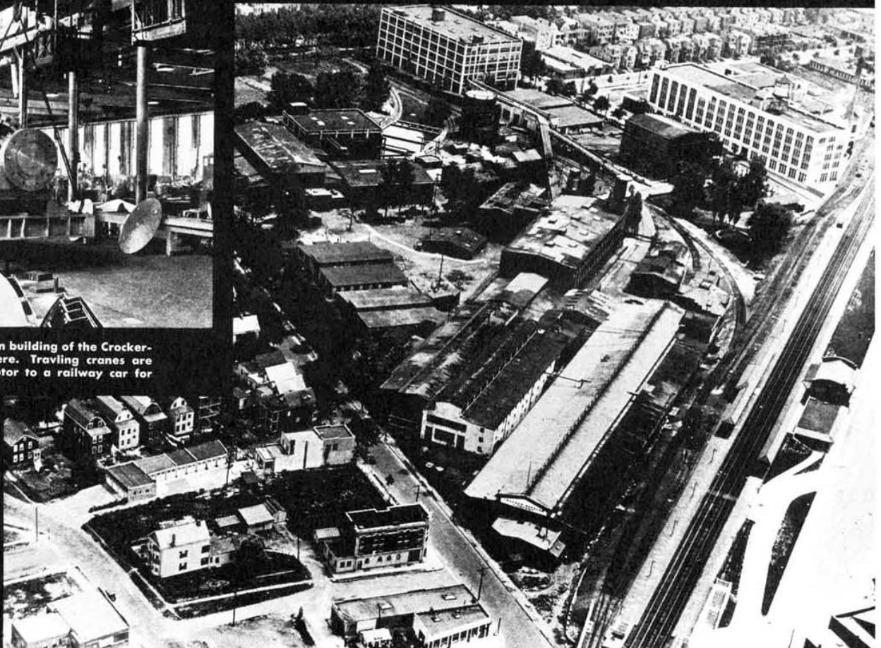
The Crocker-Wheeler plant as it looks today.