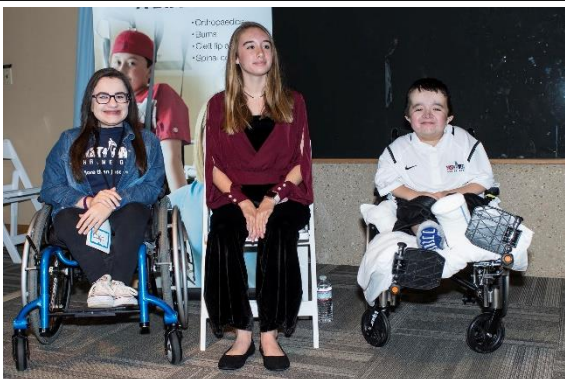
Patient Ambassadors from the Shriner's Hospital recognized at the East-West Shrine game