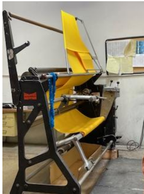
Machine to fold and wind bolts from rolls.