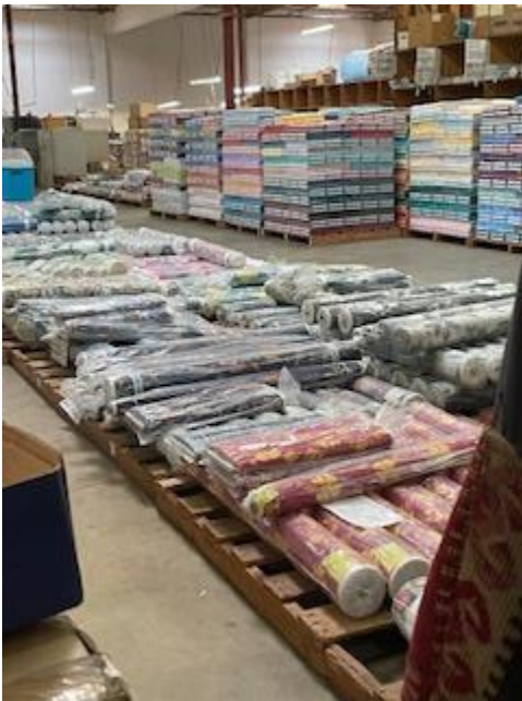
Rolls of fabric