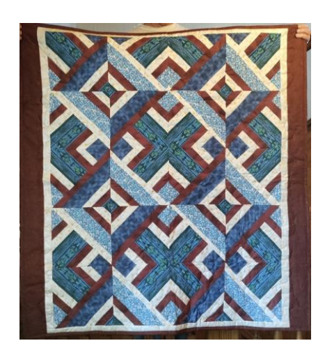
Thank You everyone!!