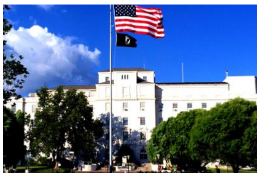
Prescott Arizona Veterans' Home