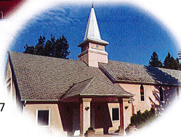
St. Margaret Mary Parish

8 St. Clair St. Devon, AB T9G 1J3 Phone: (780) 987-2858 Fax: (780) 987-2837 Parish E-mail : dcc2006@telus.net www.smgparish.ca