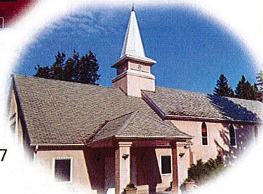
St. Margaret Mary Parish

8 St. Clair St. Devon, AB T9G 1J3 Phone: (780) 987-2858 Fax: (780) 987-2837 Parish E-mail : dcc2006@telus.net www.smgparish.ca