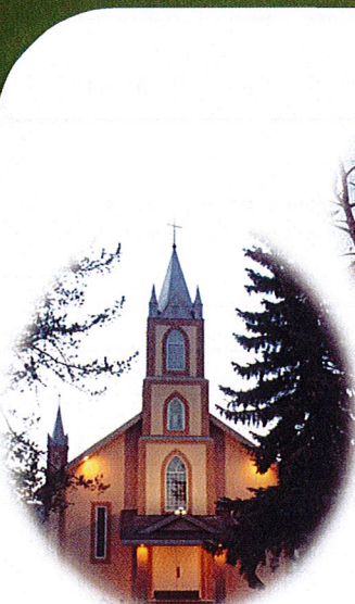
Our Lady of Victory Parish