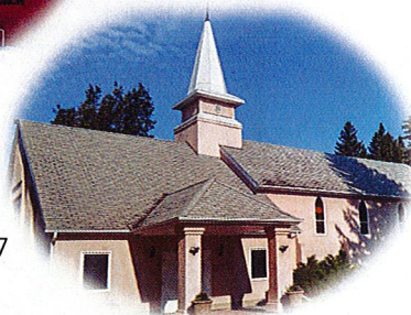
St. Margaret Mary Parish