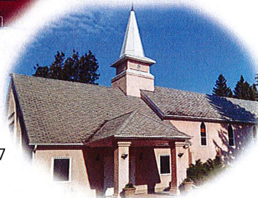
St. Margaret Mary Parish

8 St. Clair St. Devon, AB T9G 1J3 Phone: (780) 987-2858 Fax: (780) 987-2837 Parish E-mail : dcc2006@telus.net www.smgparish.ca