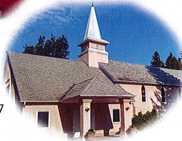
St. Margaret Mary Parish

Catholic Archdiocese of Edmonton— https://www.caedm.ca