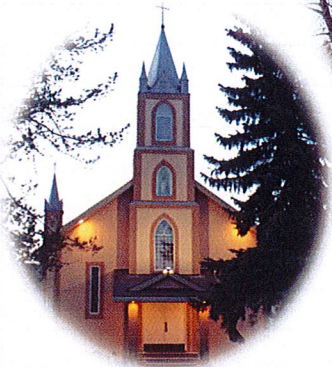
Our Lady of Victory Parish