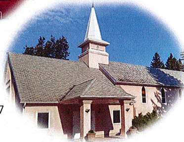
St. Margaret Mary Parish

Catholic Archdiocese of Edmonton— https://www.caedm.ca