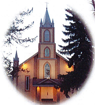
Our Lady of Victory Parish